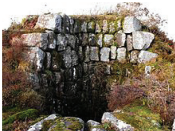
photo of Ding Dong Mine entrance

General Meeting--4th Thursday--7:00 p.m.