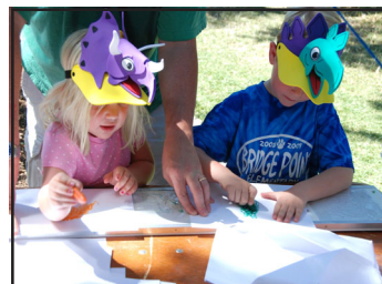
Making Dinosaur Rubbings, DinoLand Booth, Zilker Park, 9/6/2008

AGMS volunteers manned a booth at the Zilker Park DinoLand festivities on September 6 th and 7 th . Both were typical blistering hot days, but lots and lots of families and kids came out nonetheless. Our booth was situated in the shade beside the rose garden. There were several raised impressions of dinosaurs for the children to rub over with crayons and get their own pictures to take home. It was immensely popular. Several kids wanted each dinosaur, and in a different color.