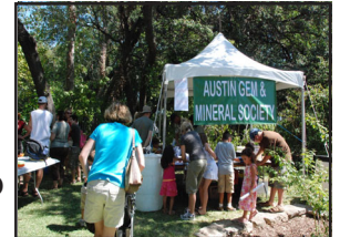
AGMS DinoLand Booth, Zilker Park, 9/6/2008

AGMS volunteers manned a booth at the Zilker Park DinoLand festivities on September 6 th and 7 th . Both were typical blistering hot days, but lots and lots of families and kids came out nonetheless. Our booth was situated in the shade beside the rose garden. There were several raised impressions of dinosaurs for the children to rub over with crayons and get their own pictures to take home. It was immensely popular. Several kids wanted each dinosaur, and in a different color.