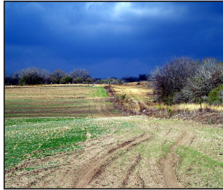
Bordovsky Ranch

On Saturday, December 7 th , 2008, about Karnes City to hunt the Bordovsky Ranch sought after “shrink wood” and palm mens and lapidary materials. The day but soon warmed up to an absolutely shirt-sleeve weather abounded with temperatures in the upper 60’s to lower 70’s, a beautiful sky, and no wind.